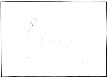
Vancouver Police Department seal