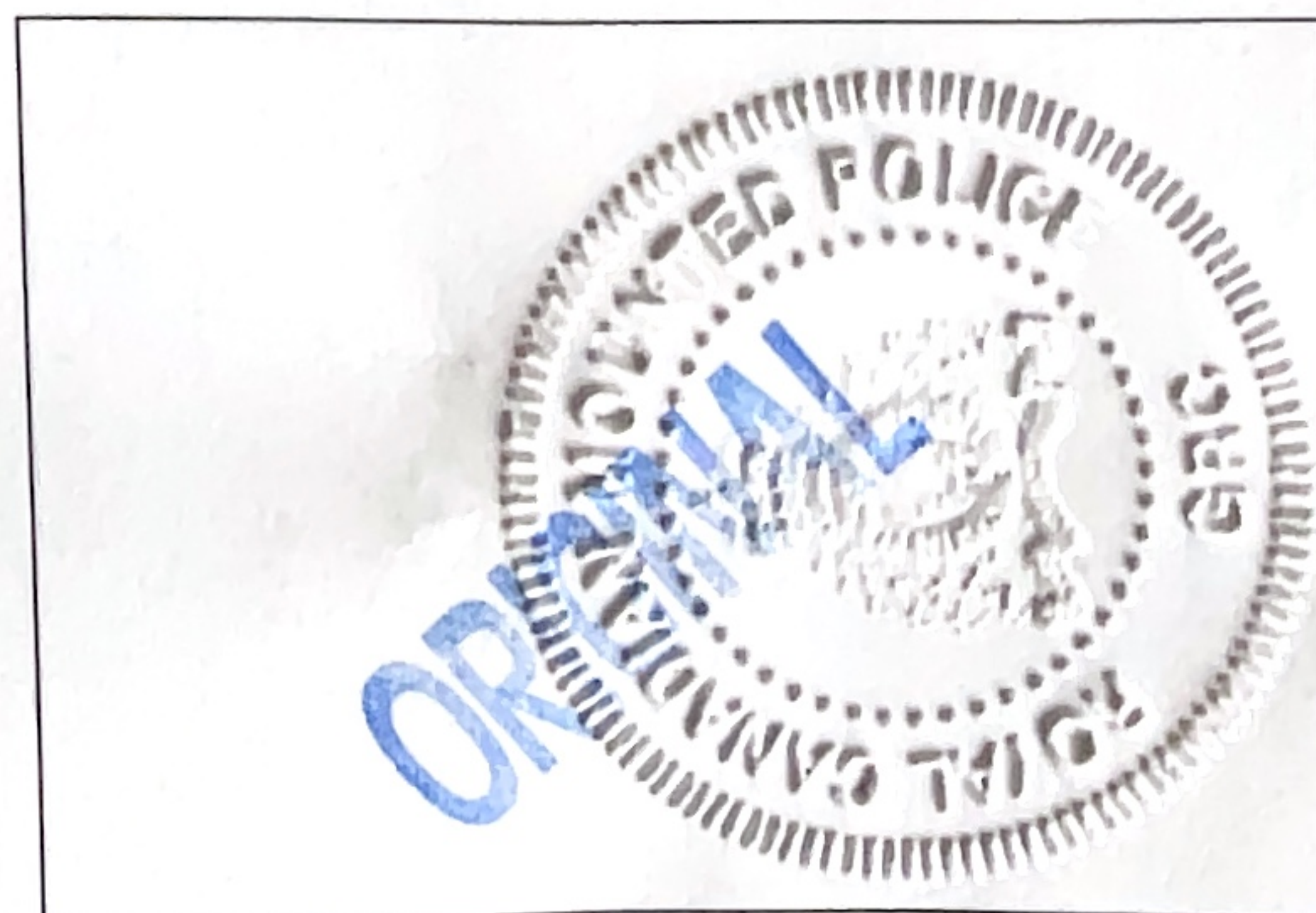
Columbia Valley RCMP seal